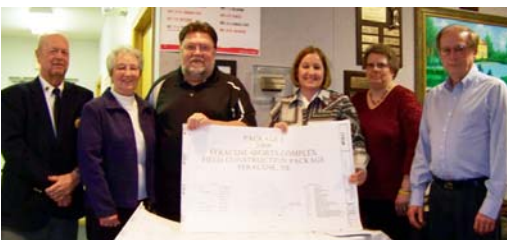
This photo is of the Syracuse Parks Department congratulating Post 100, VFW 5547 and their Auxiliaries for raising $25,000 dollars for the new sports complex, which is under construction. It is expected that it will be used to purchase a score board and other needs for the Veterans Field portion.

GOD PLEASE WATCH OVER AND PROTECT OUR TROOPS