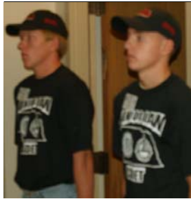
As two Junior Law Cadets stand outside of their room, they may admit the first day is not all that easy.